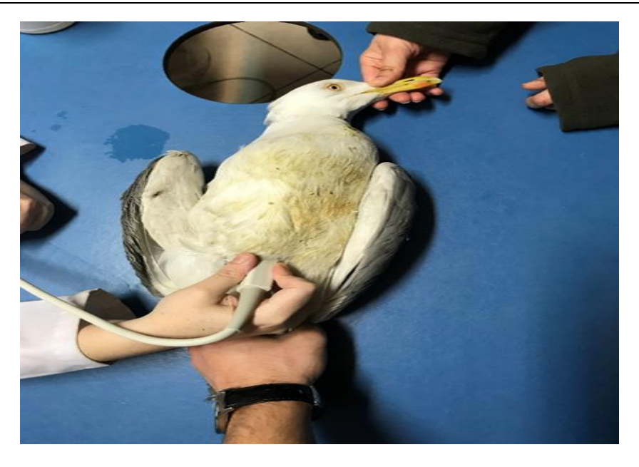
Figure 1: Ultrasonografic examinations of the gulls