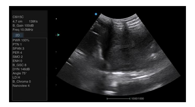
Figure3: Poor visualization due to air sacs.