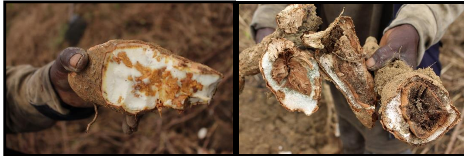
Figure 1: Severe cassava root necrosis due to CBSD-like at INERA- Mvuazi research center.

Several attempts to identify the causative agent responsible for CBSD-like disease in western in DRC have been undertaken since 2004 using cassava leaf samples, including those from plants showing very severe symptoms, with no success to date [18].