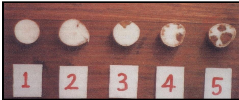
Figure 2: Root necrosis severity scores

The first trial was established according to the split plot experimental design with variety as the main factor and the cuttings phytosanitary state as a secondary factor, in three replications. The elementary plot was 5m x 10m.