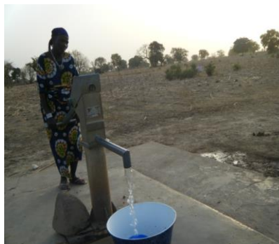
Photo 1: Borehole equipped with a manual pump in the Kokey district

These are boreholes equipped with a submerged pump and a manual or foot-operated pumping system. The boreholes are four hundred and fifty-one (451) of which three hundred and ninety-eight (388) are functional. distributed in the ten districts of the Municipality of Banikoara and mainly supply the populations. Two models of boreholes equipped with Human Motricity Pumps (FPM) are installed. These are foot pumps and hand pumps (Photo 11 and 2).