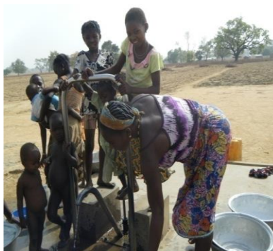
Photo 2: Borehole equipped with a foot pump in the district of Ounet