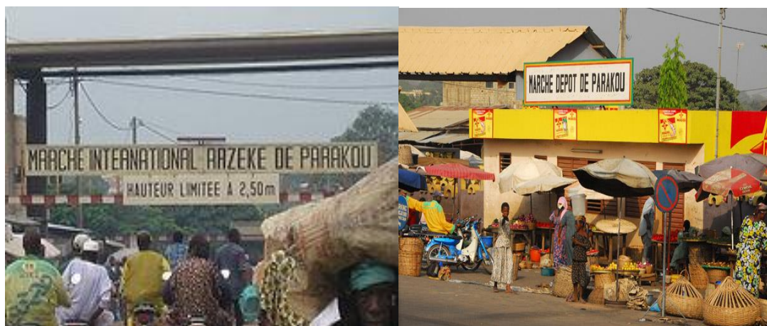
Plate 1: Partial view of the Arzèkè (a) and Dépôt (b) markets

The economy of the municipality of Parakou is essentially based on an industrial fabric making the city an industrial hub for the development of large aircraft transport activities, a predominant informal sector, a booming banking sector with the presence of the main banks of Benin , a flourishing commercial sector, a developed artisanal sector. The activities which occupy the populations of the Arzèkè and Dépôt markets are essentially commerce. Indeed, the Arzèkè and Dépôt markets attract a large number of users per day, i.e. 1720 for Arzèkè and 700 for Dépôt (SGMP, 2016) (Plate 1