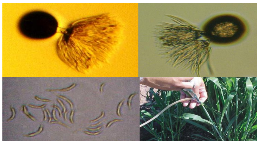
Figure 2. Teliospore germination, producción of primary and secondary sporidia, and inoculation by injection during the boots tage of the wheat plant.