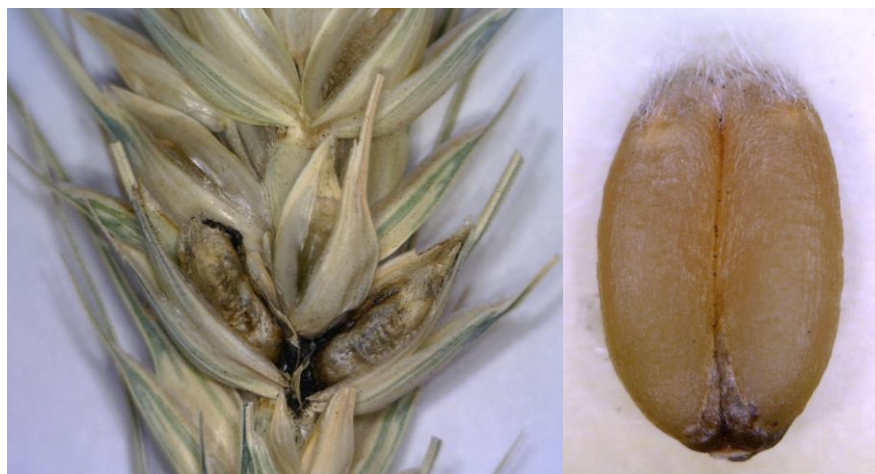
Figure 1. Wheat spike with infected grains with Tilletia indica . The grain shows a characteristic lesion caused by the pathogen.

1975), Nepal (Singh et al. , 1989), Brazil (Da Luz et al. , 1993), The United States of America (APHIS, 1996), Iran (Torarbi et al. , 1996), the Republic of South Africa (Crouset et al. , 2001), and Afghanistan (CIMMYT, 2011). It is common that the fungus affects partially some grains in a spike, and not all the spikes are affected in a plant (Bedi et al. , 1949) (Fig. 1), but in some occasions, grains may be totally destroyed; although the fungus may penetrate the embryo, it is not necessarily lethal (Chona et al. , 1961; Mitra, 1935). Partially infected grains may produce healthy plants, although there are reports that indicate that the percentage of germination decreases depending on the level of infection of the grain (Bansal et al. , 1984; Rai and Singh, 1978; Singh, 1980), and that severely affected seeds lose viability or show abnormal germination (Rai and Singh, 1978); Fuentes-Dávila et al. , 2013 reported that seed with the greatest infection, but with the embryo intact, produced the highest number of tillers.