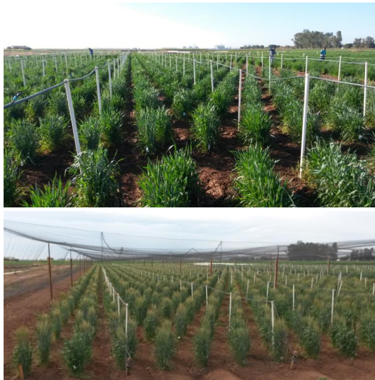
Figure 3. Mist-irrigation and anti-bird net in the experimental area, where bread wheat germplasmise valuated for their reaction to artificial inoculation with Tilletia indica .

The range of the percentage of infection of the advanced lines in the first date was 0-75.18% with a mean of 17.89%; the infection categories in this date were: 25 lines did not show any infected grains, 66 fell in the 0.1-2.5% category, 63 in the 2.6-5.0%, 165 in the 5.1-10.0%, 592 in the 10.1-30.0% category, and 181 showed an infection percentage greater than 30.0%. In this date, lines with less than 10% comprise 29.21% of the group which would offer an acceptable reaction to the inoculation with Tilletia indica , the causal agent of the disease.